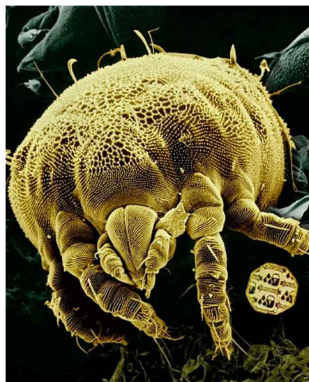
Microholograms tiny metallic particles range in the size from 40 micrometers to half a millimeter

However, an alarmed user can go deeper and inspect a document with a magnifier seeing their regular shape, engraved letters, and holographic surface.